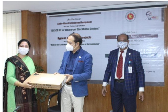
Handing Over of Educational Equipment