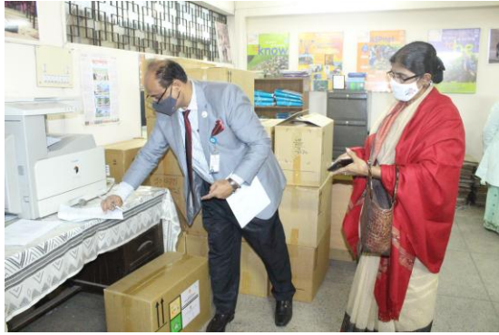
Handing over of Products