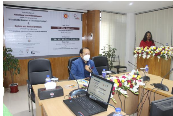
DSG, BNCU Addressing the Participants