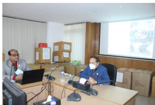
DSG, BNCU Checking the Products