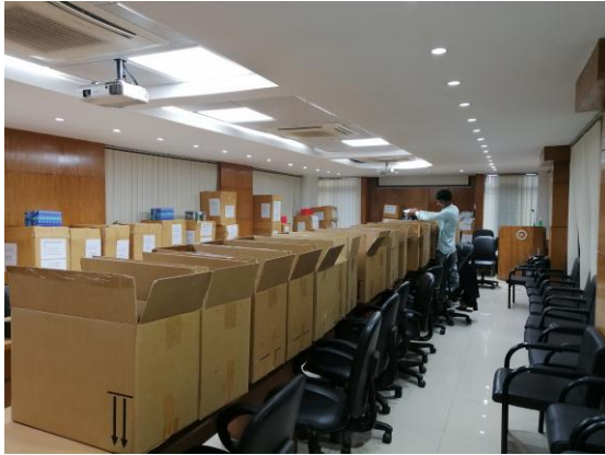
Preparation of Distribution