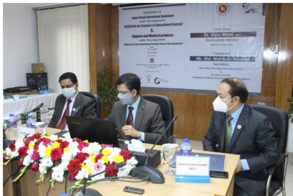
Secretary General, BNCU and DSG BNCU