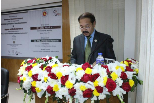
DSG, BNCU with welcome Address