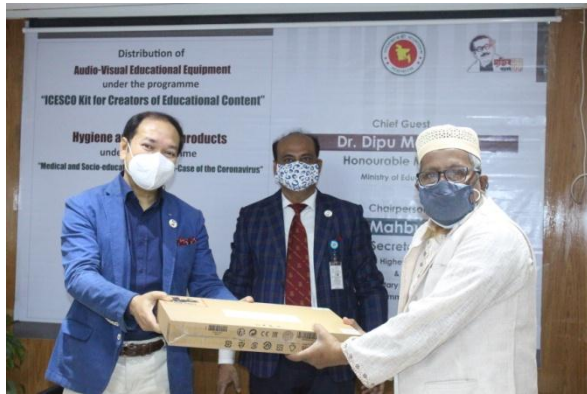
Handing Over of Educational Equipment