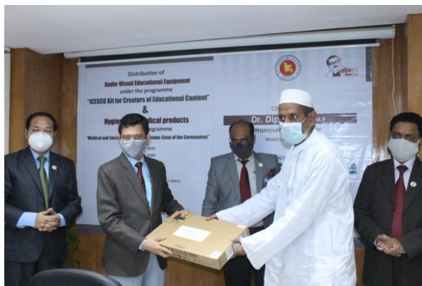
Handing Over of Educational Equipment