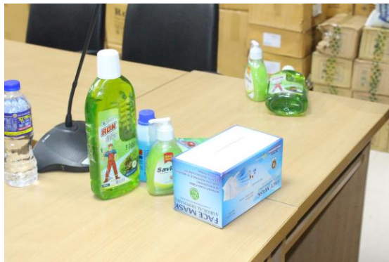
Sample of Different Hygiene Products

The allocated money was received in June of this year. The whole country was under lockdown till July. The Secretary General including many of the BNCU officials and staffs were corona positive. As a matter of fact, the overall situation was quite out of the hand posing serious challenges to execute the program. In fact, the chairperson of BNCU is currently suffering from COVID-19. Amidst all these hurdles, BNCU started all the procedures as soon as the situation got favorable. It was difficult to engage all the stakeholders due to the critical situation. Yet, BNCU tried to reach as many of its stakeholders as possible. Finally, after completing the papers, selection process, procurement and acquisition of products, BNCU successfully arranged the distribution ceremony on 24 th and 26 th December with the consent of the Chairperson of BNCU.