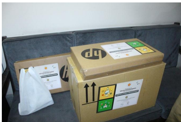
Packages of Educational Products