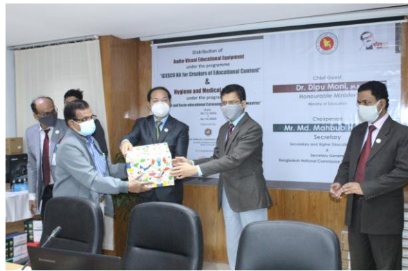
Handing over Token Products