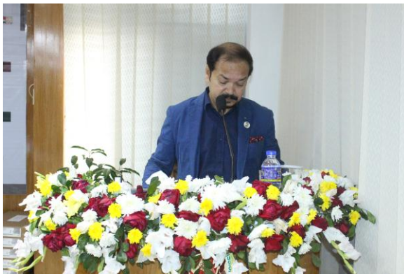
DSG, BNCU Speaking at the Programme