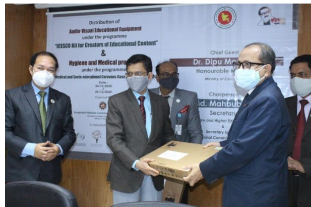
Handing Over of Educational Equipment