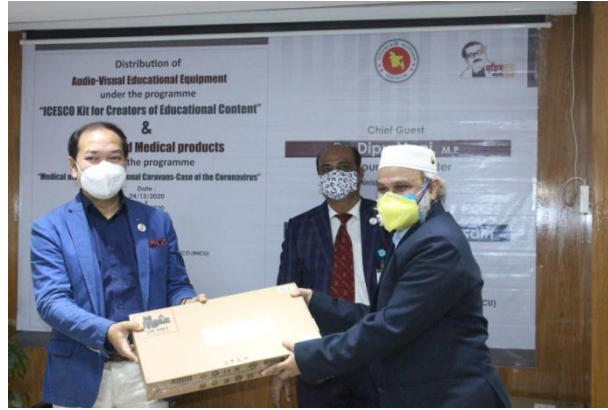
Handing Over of Educational Equipment