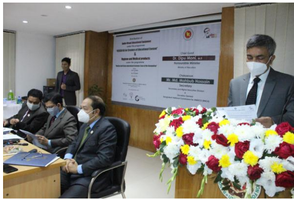
Participant Speaking at the Programme