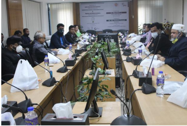
Participants at the Programme