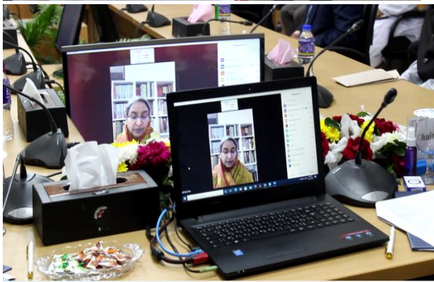
Hon'ble Minster for Education Dr. Dipu Moni M.P. Virtually Connected at the Programme