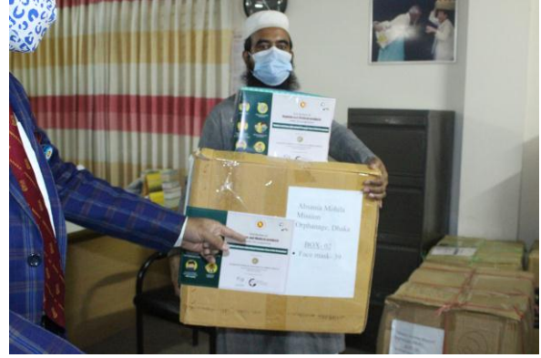
Handing over of Products