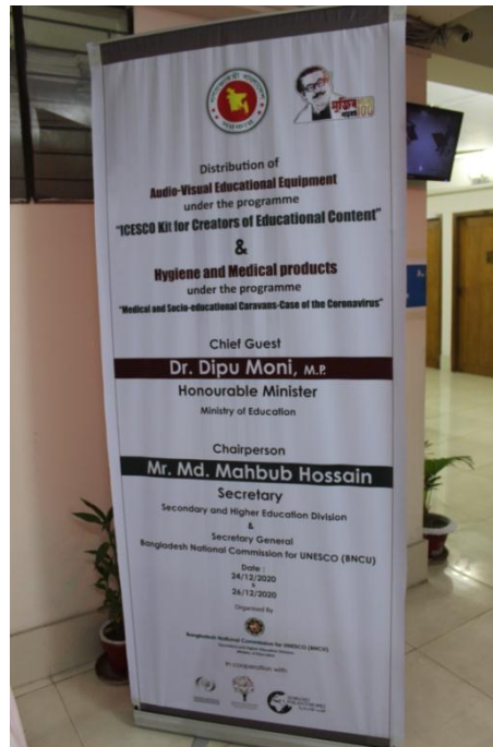
Banner of the Programme