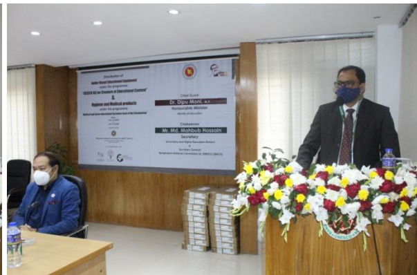
Participant Speaking at the Programme