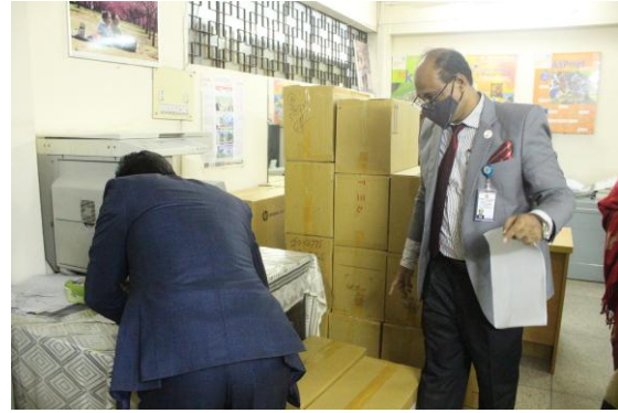
Handing over of Products