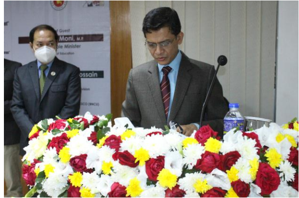
Secretary General, BNCU Speaking as the Chair