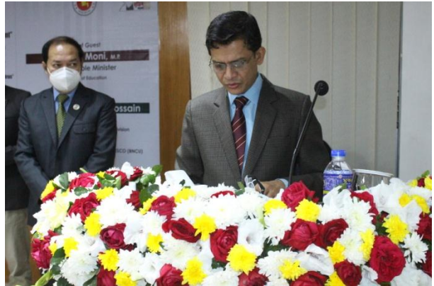
Secretary General, BNCU Speaking at the Programme