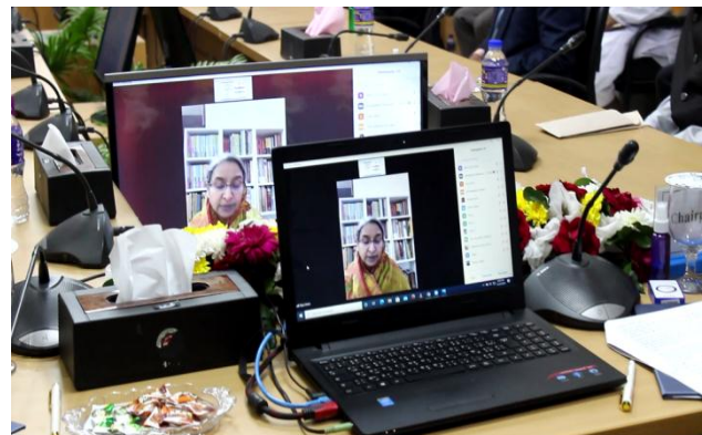
Hon'ble Minister for Education Dr. Dipu Moni M.P.