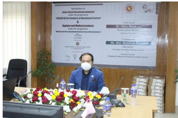
BNCU at the Programme