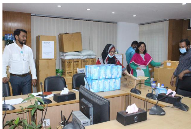
Officers and staffs working