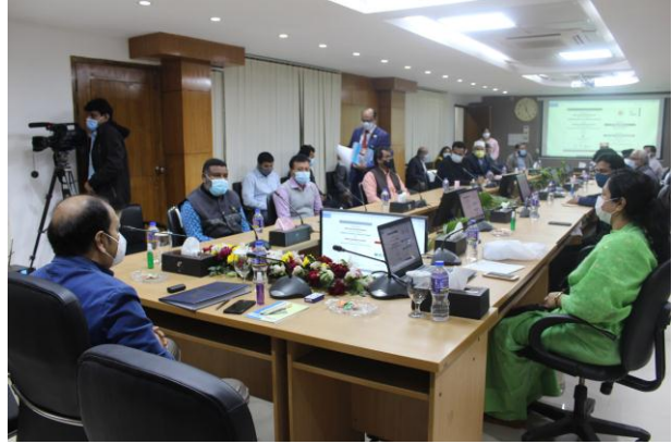
Media Coverage of the Programme