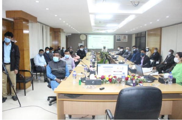
Participants at the Programme