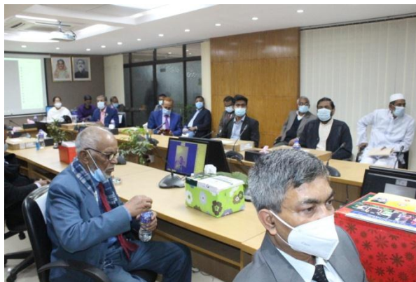
Participants at the Programme