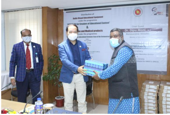
Handing Over of Token Products