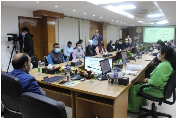
Media Coverage of the Programme DSG,