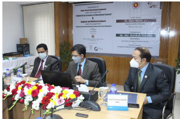
Secretary General & DSG, BNCU