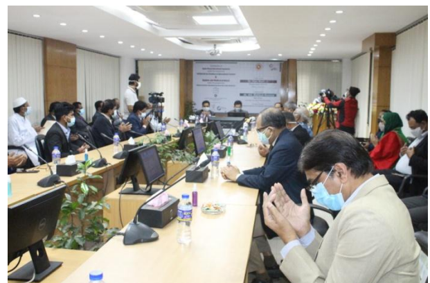
Dua & Prayers