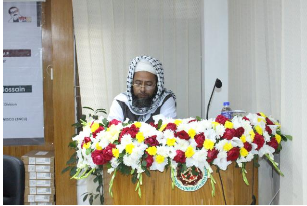
Recitation from the Holy Quran