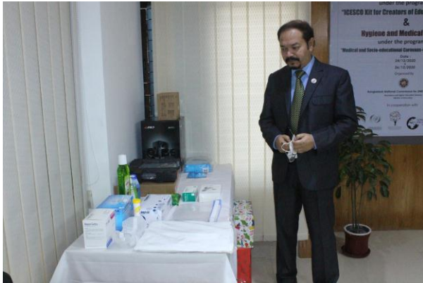
DSG, BNCU observing the products