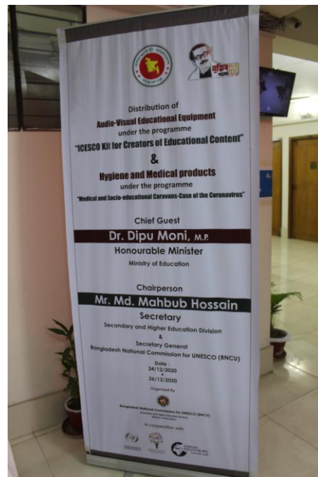
Banner of the Programme