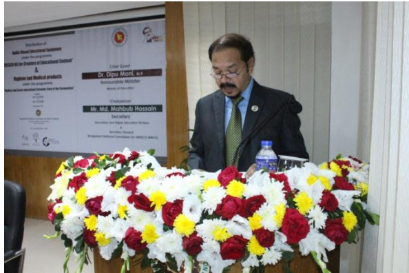
DSG, BNCU with Welcome Address