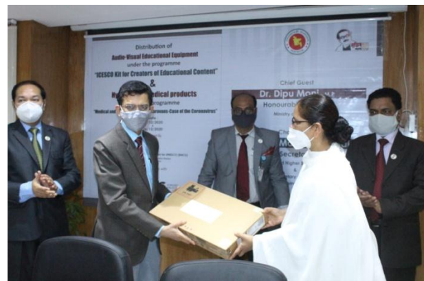
Handing Over of Educational Equipment