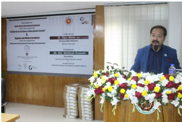
DSG, BNCU at the Programme