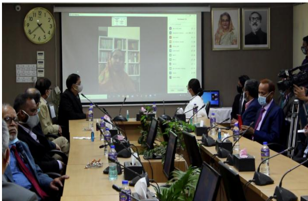
Hon'ble Minster for Education Dr. Dipu Moni M.P. Virtually Connected at the Programme