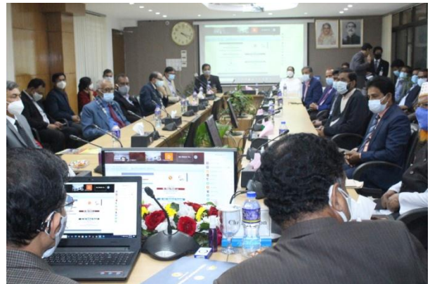
Participants in the Programme