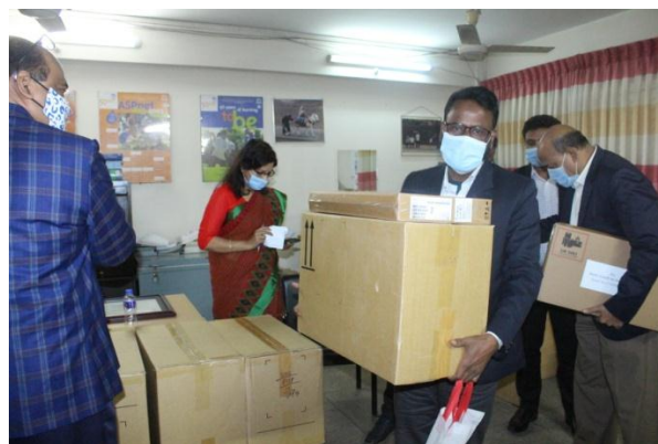
Handing Over of Educational Equip