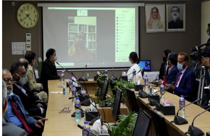
Hon'ble Minister for Education Dr. Dipu Moni M.P. Virtually Connected at the Programme