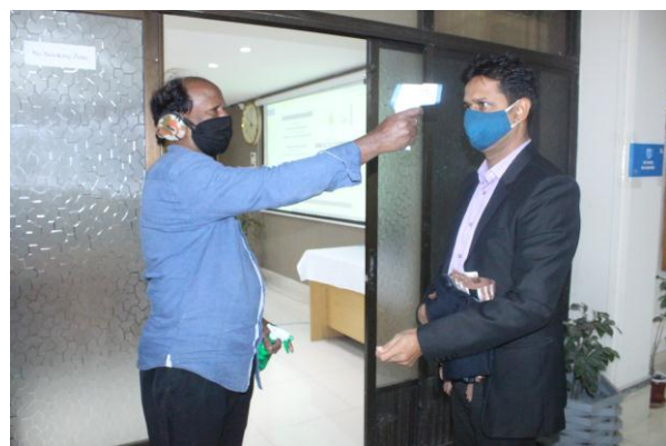
Health safety Measures