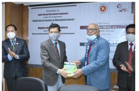
Handing over of Token Products