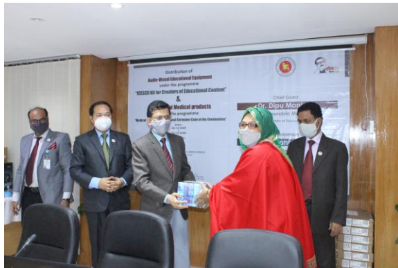
Handing over of Token Products