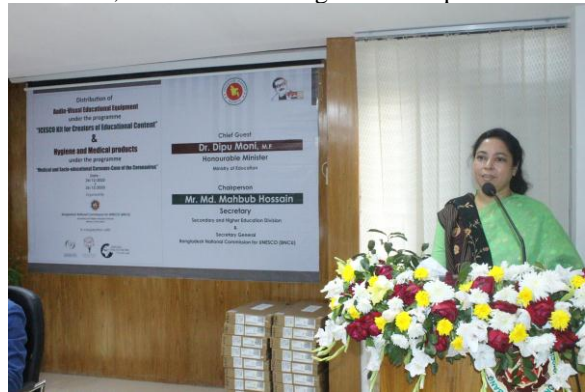
Participant Speaking at the Programme