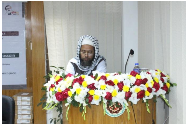
Recitation from the Holy Quran