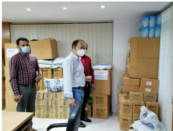
Deputy Secretary General Monitoring Packages