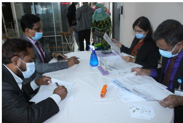
Registration going on