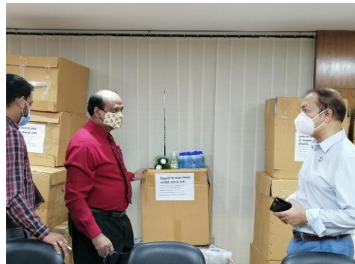
Deputy Secretary General briefing the officers