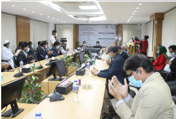
Participants in the Programme