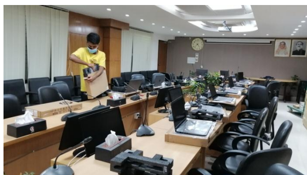
Preparing Education Equipment for Distribution

The allocated money was received in May of this year. The whole country was under lockdown till July. The Secretary General including many of the BNCU officials and staffs were corona positive. As a matter of fact, the overall situation was quite out of the hand. In fact, the chairperson of BNCU is currently suffering from COVID-19. Amidst all these hurdles, BNCU started all the procedures as soon as the situation got favorable. It was difficult to engage all the stakeholders due to the critical situation. Yet, BNCU tried to reach as many of its stakeholders as possible. Finally, after completing the papers, selection process, procurement and acquisition of products, BNCU successfully arranged the distribution ceremony on 24 th and 26 th December with the consent of the Chairperson of BNCU.